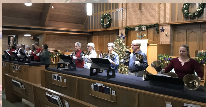
EPIPHANY RINGERS chimed the joyful news of Christ's coming.