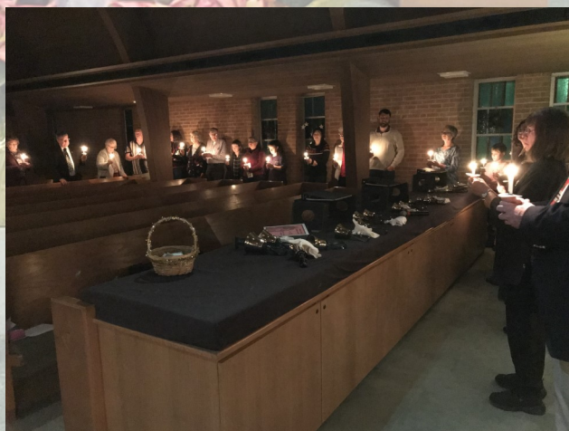
THE EVENING ENDED with a circle of light, as West Siders looked forward to sharing the light of the world.